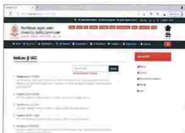
Notices @ UGC www.ugc.ac.in/ugc_notices.aspx

Ragging is a criminal offense and UGC has framed regulations on curbing the menace of ragging in higher educational institutions in order to prohibit, prevent and eliminate the scourge of ragging. In pursuance to the Judgment of the Hon'ble Supreme Court of India dated 08.05.2009 in Civil Appeal No. 887/2009, in exercise of the powers conferred by clause (g) of sub-section (1) of section 26 of the University Grants Commission Act, 1956, the UGC notified "Regulations on Curbing the Menace of Ragging in Higher Educational Institutions, 2009". These regulations are mandatory for all universities/ institutions.