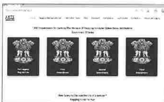
UGC Regulations www.antiragging.in/assets/pdf/annexure/Annexure-I.pdf